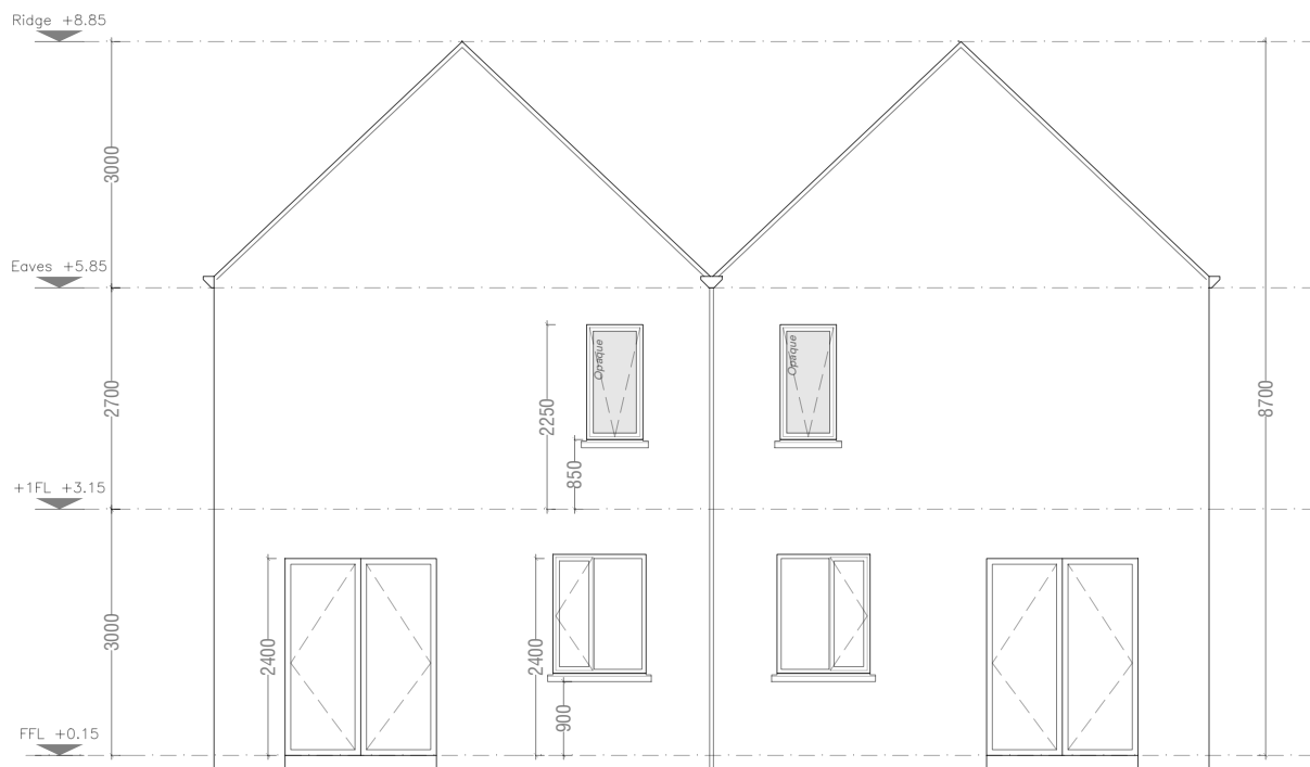
House Type L1 Semi- Detached Rear Elevation