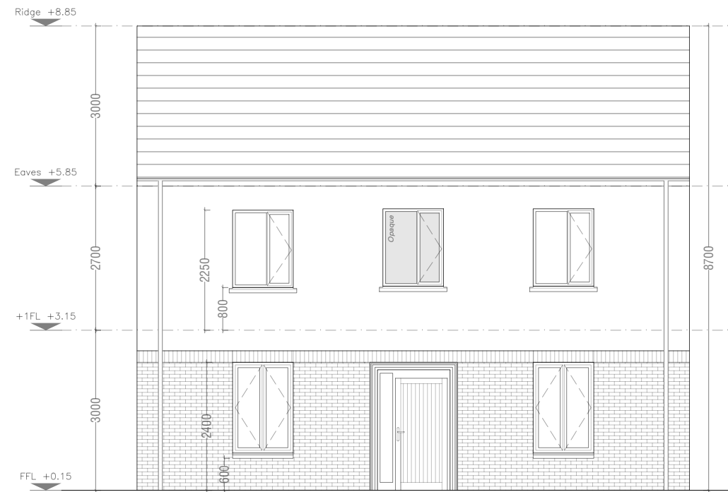
House Type L1 Semi- Detached Side Elevation