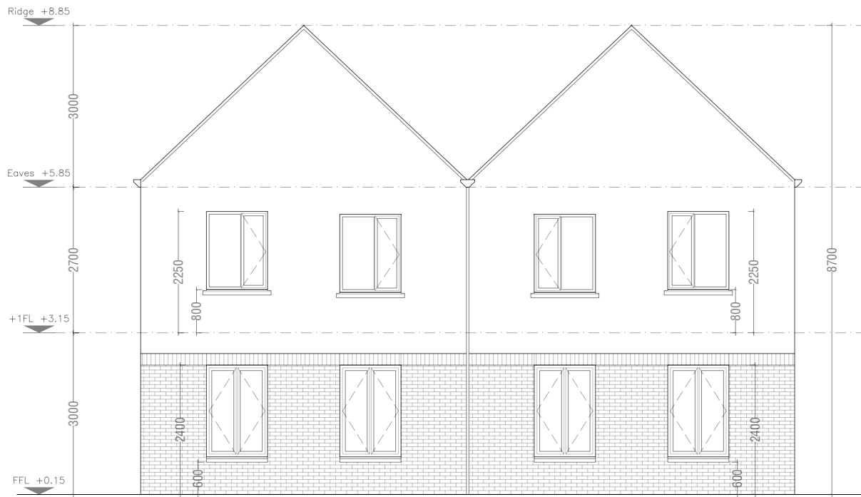
House Type L1 Semi- Detached Front Elevation